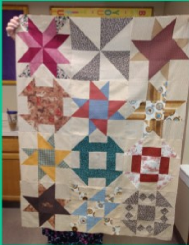
Sampler lap quilt made with squares donated by the Soughton UCC. Thank You!